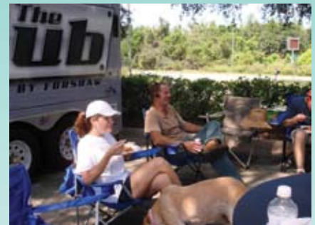
Taking a break to eat!