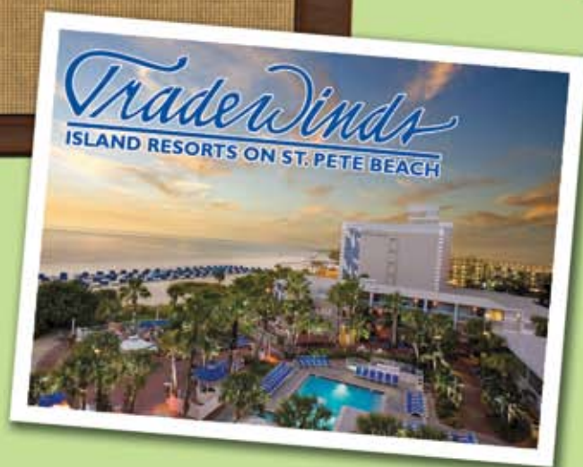
Tradewinds Resort, St. Pete Beach Site of the FPMA 2010 Summer Conference.