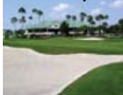
Pasadena Yacht and Country Club

Paddleboats —Hop aboard a paddleboat and cruise under bridges, around islands and come beak to nose with one of our resident swans at Island Grand. This meandering waterway is home to graceful Japanese koi, schools of Nile perch and a variety of herons and egrets. Fish-feeding stations are located alongside the banks. Included in the resort fee.