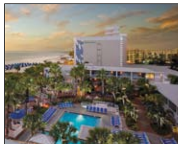
TradeWinds Island Grand Resort

Call 1-800-808-9833 and refer to FPMA Summer Conference 2010.